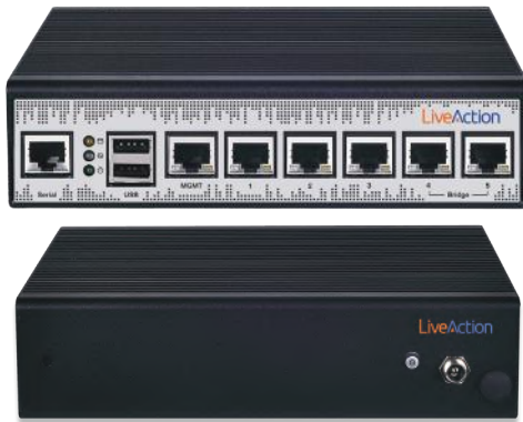
Front and Back Panels